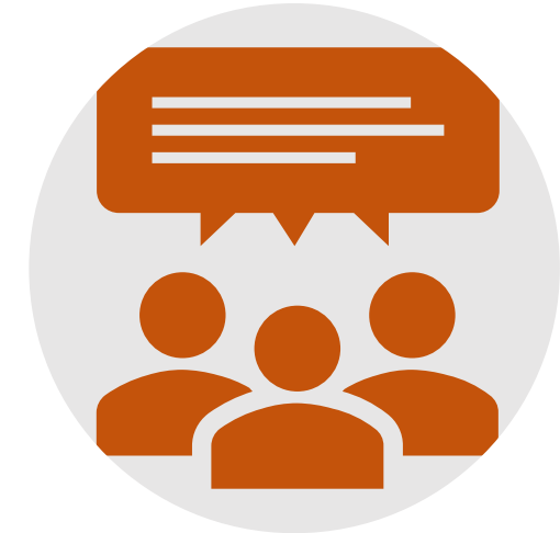
Continued Biweekly Learning Community Calls