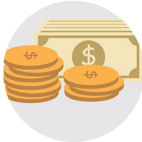
Final Round of Seed Funding Awards