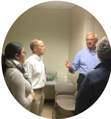
On-site Hubs Meeting paired with Analogous Safari Site Visit

Activities we have on the docket for the rest of the year