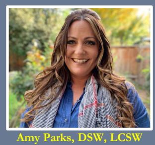
Project Lead, DBP Faculty Department of Pediatrics