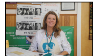
Volunteers are so important in making our patients feel welcome when they come for office visits.