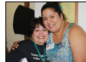
My coworkers at WC have become my best friends.