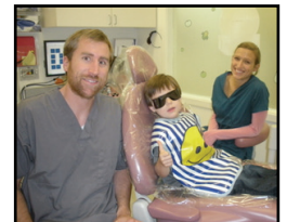
Making exam rooms more kid-friendly really helps them relax.