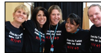
I love knowing that what we do really makes a difference in our patients' lives.